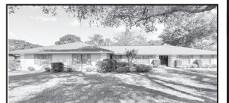
Sabal Point | $349,900

Continuing the Huskey Real Estate Tradition/Developer of Sweetwater Oaks