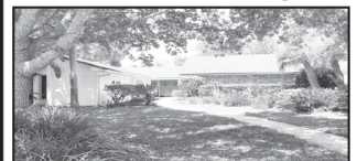
Sweetwater Oaks | $389,900